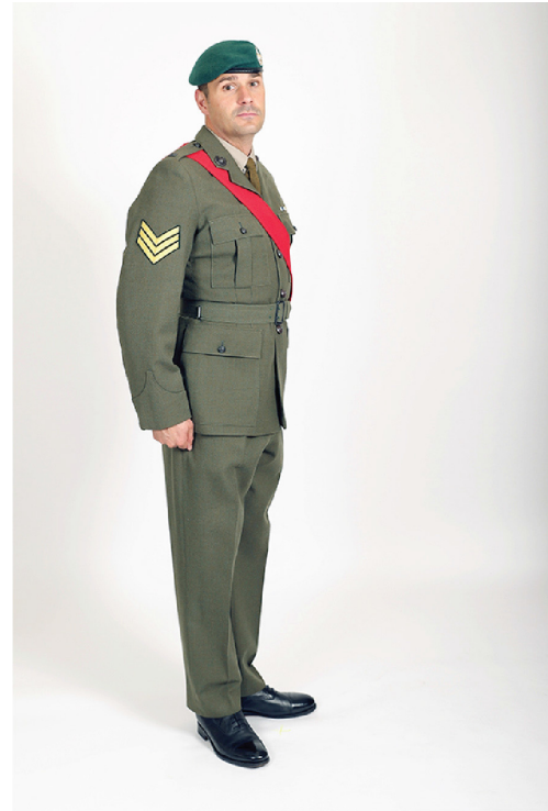
Fig 40A-3f. SNCO in No. 1C Lovat Undress (Sash Order)