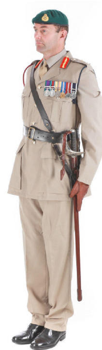
Fig 40A-13b. General Officer in No. 1AW Dress (Stone Prestige Suit Order)