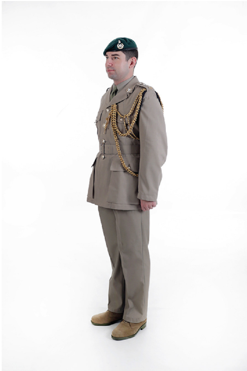
Fig 40A-15a. Junior officer (ADC) in No. 1CW Dress (with desert boots)