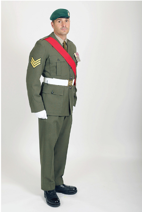
Fig 40A-2e. SNCO in No. 1B Lovat Dress with white belt and gloves