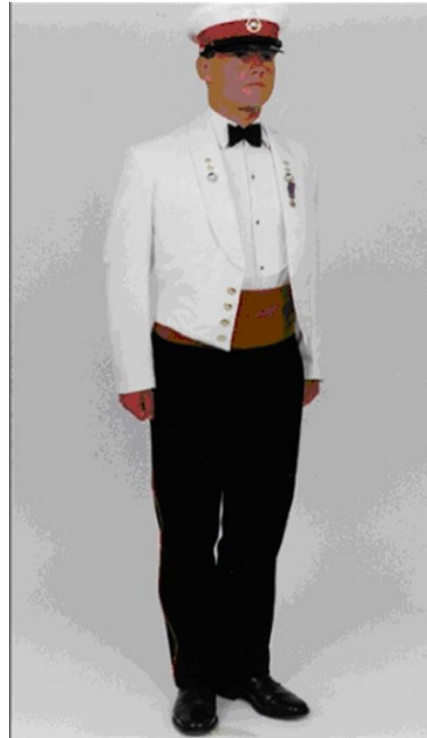
Fig 40A-17c. Cpl in No. 2BW Mess Undress (Alternative Bow Tie Order)