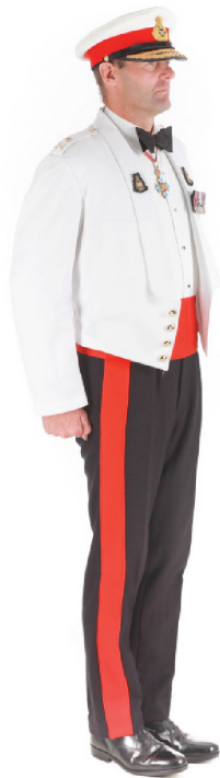
Fig 40A-17a. General Officer in No. 2BW Mess Undress