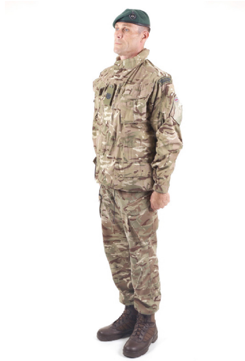
Fig 40A-10b. WO2 in No. 3D Dress (Windproof Smock Order)