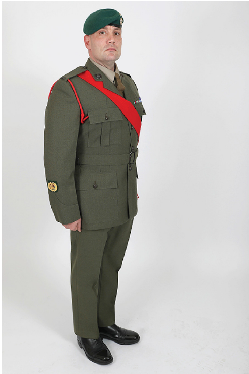
Fig 40A-3e. WO2 in No. 1C Lovat Undress