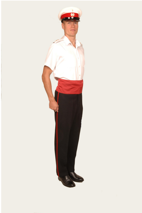
Fig 40A-6a. Junior officer in No. 2C Dress (Red Sea Rig)