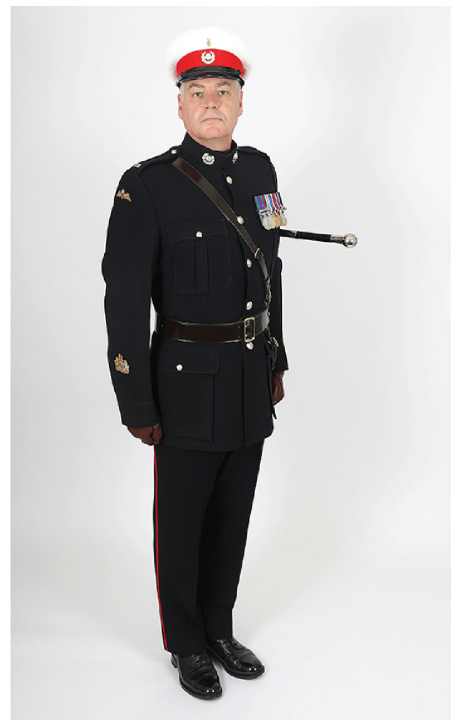
Fig 40A-1f. WO1 in No. 1A Regimental Blue Dress with peaked cap, cane and gloves