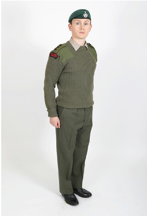
Fig 40A-9a. Junior officer in No. 3C Dress