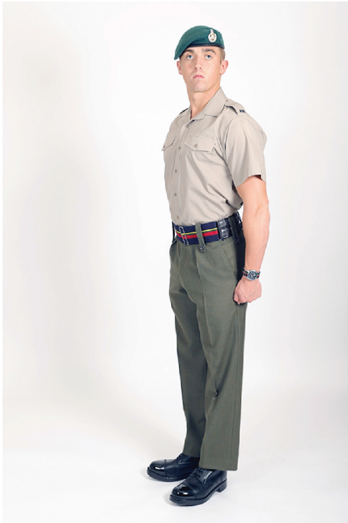
Fig 40A-7c. Cpl in No. 3A Dress