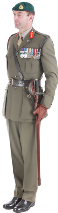
Fig 40A-2a. General Officer in No. 1B Lovat Dress with Sam Browne and gloves