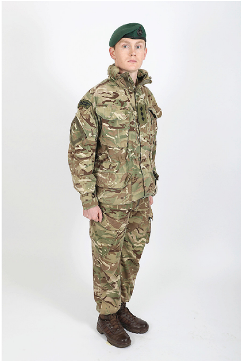
Fig 40A-10a. Officer in No. 3D Dress