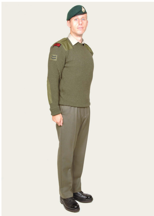
Fig 40A-9c. Cpl in No. 3C Dress