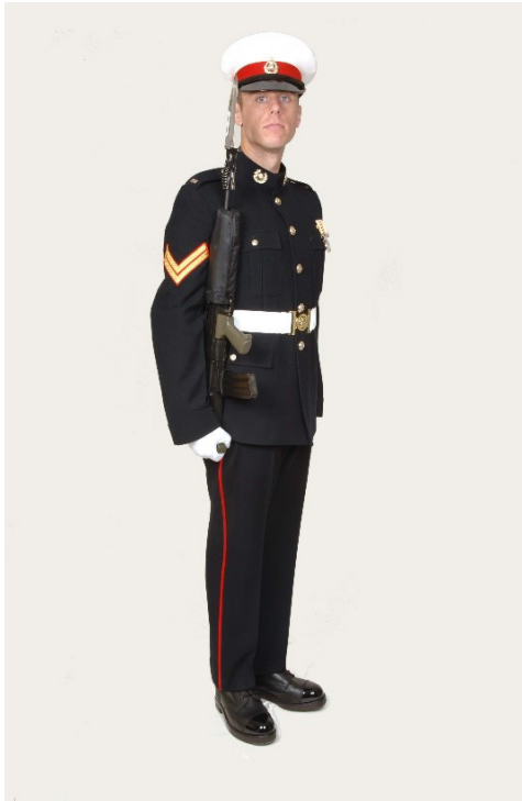
Fig 40A-1i. Cpl in No. 1A Regimental Blue Dress with peaked cap, rifle and gloves