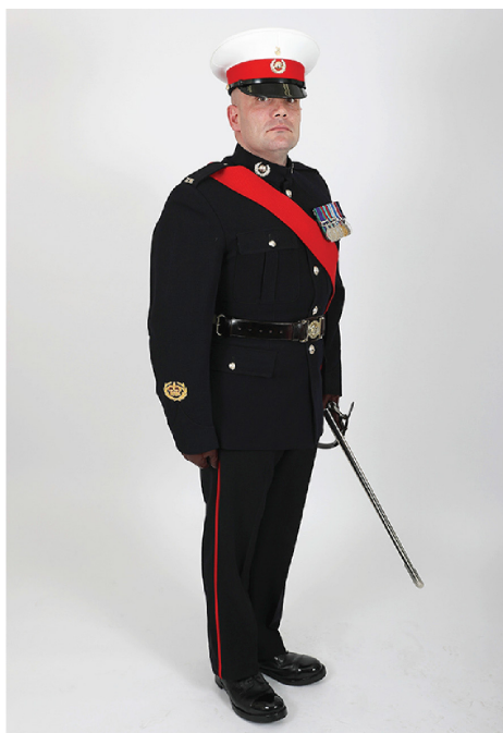
Fig 40A-1g. WO2 in No. 1A Regimental Blue Dress with peaked cap, sword and gloves