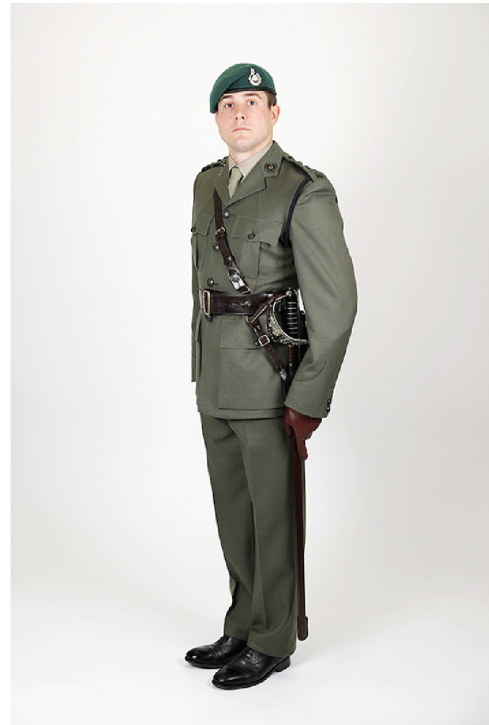
Fig 40A-2b. Junior Officer in No. 1B Lovat Dress with Sam Browne, sword and gloves