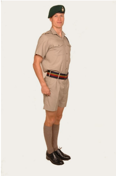
Fig 40A-20a. Junior officer in No. 3BW Dress