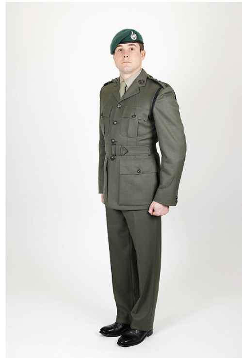
Fig 40A-3b. Junior Officer in No. 1C Lovat Undress