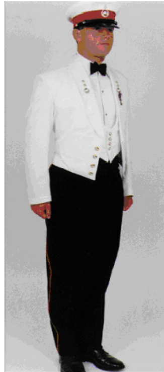
Fig 40A-16c. Cpl in No. 2AW Mess Dress (Alternative Bow Tie Order)