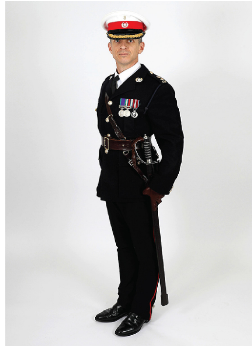
Fig 40A-1b. Lt Col in No. 1A Regimental Blue Dress (Mounted Order)