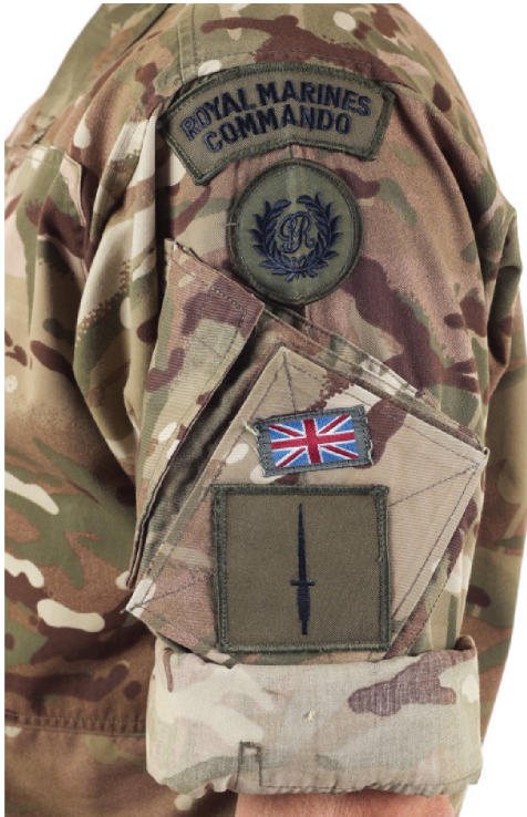
Fig 40A-10e. No. 3 Dress Left Arm with Commando Flash, King's Badge, Union Flag and Formation Flash