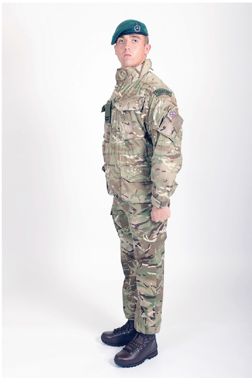
Fig 40A-10c. Cpl in No. 3D Dress (Windproof Smock Order)