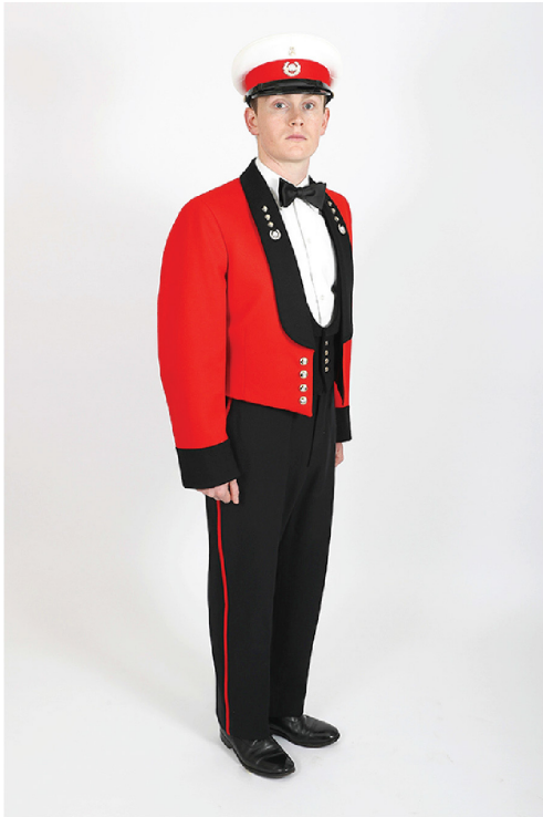
Fig 40A-4c. Junior officer in No. 2A Mess Dress