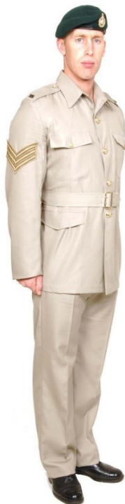
Fig 40A-15c. SNCO in No. 1CW Dress