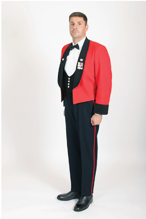
Fig 40A-5c. SNCO in No. 2B Mess Undress