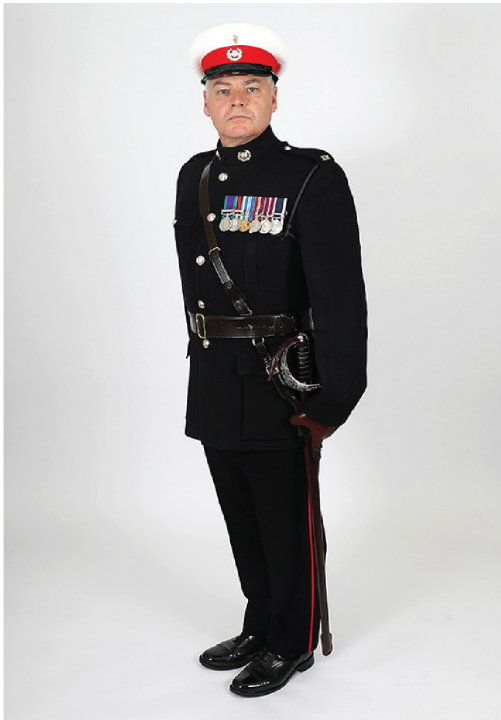
Fig 40A-1e. WO1 in No. 1A Regimental Blue Dress with peaked cap, sword and gloves