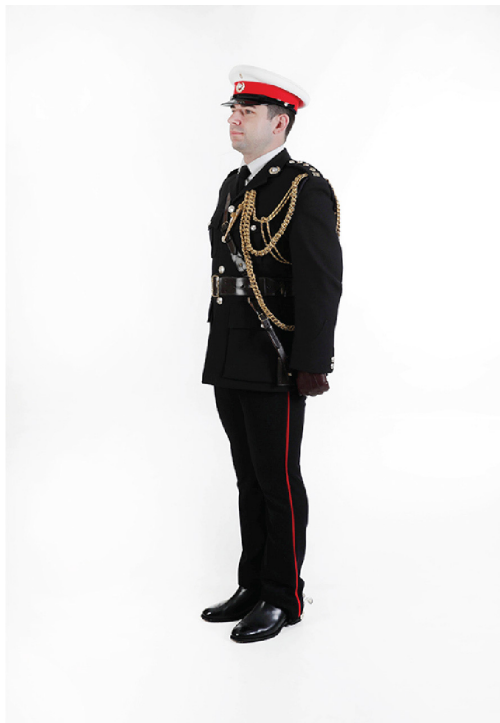
Fig 40A-1c. ADC in No. 1A Regimental Blue Dress (Mounted Order) (negative sword but with gloves)