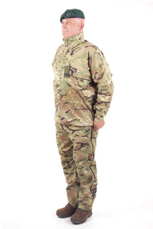
Fig 40A-8c. Cpl in No. 3B Dress (Waterproofs Order)