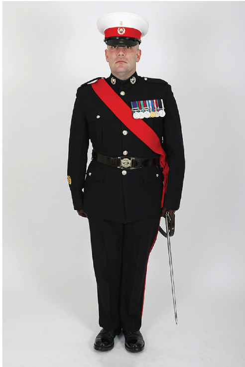
Fig 40A-21a. Front view