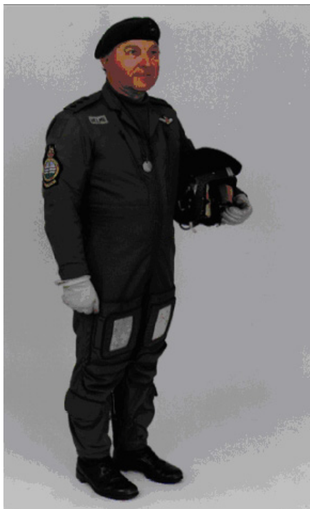
Fig 40A-12a. Aircrew in No. 5 Dress