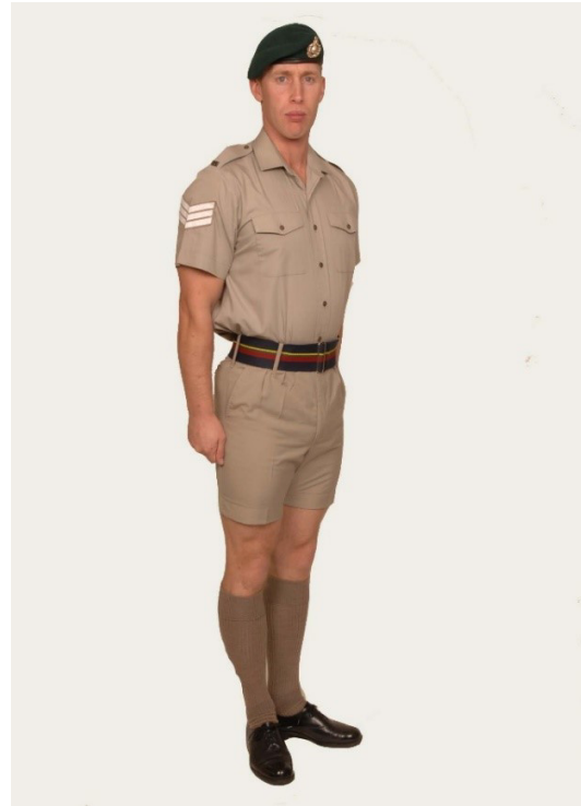
Fig 40A-20c. Cpl in No. 3BW Dress