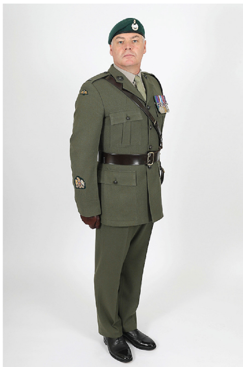
Fig 40A-2c. WO1 in No. 1B Lovat Dress with white belt and gloves