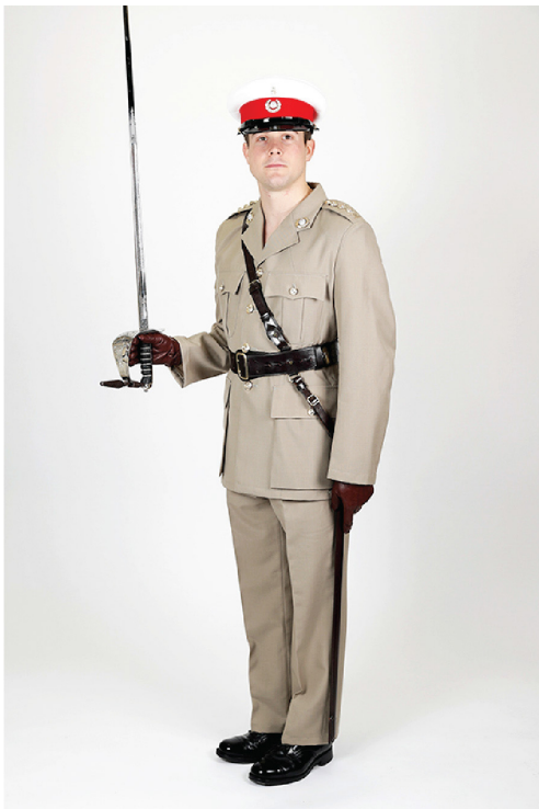
Fig 40A-13c. Junior Officer in No. 1AW Dress (Cap and short sword knot)