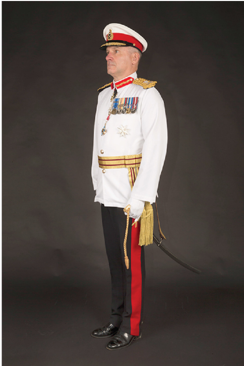
Fig 40A-13a. General Officer in No. 1AW Dress (White Full Dress)