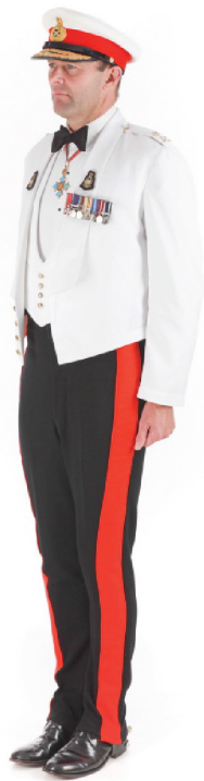
Fig 40A-16a. General Officer in No. 2AW Mess Dress