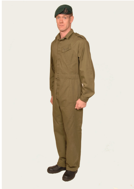
Fig 40A-12c. Vehicle Mechanic in No. 5 Dress