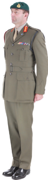
Fig 40A-3a. General Officer in No. 1C Lovat Undress