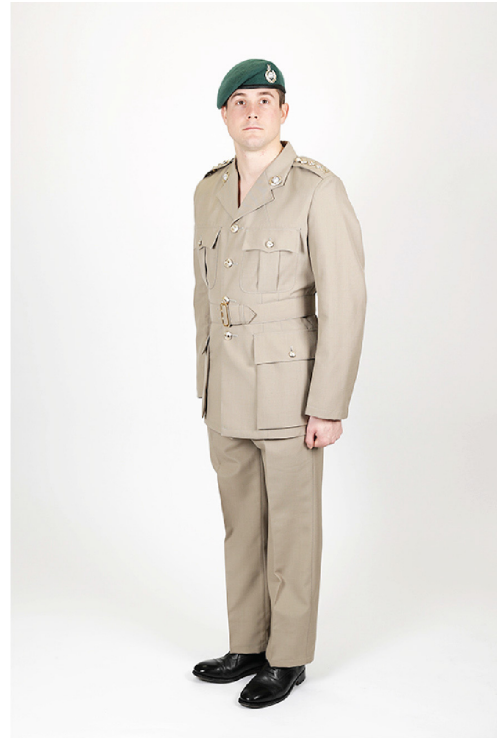
Fig 40A-15b. Junior officer in No. 1CW Dress