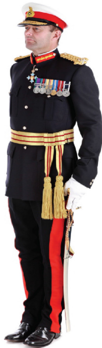
Fig 40A-1a. General Officer in Army No. 1 Dress