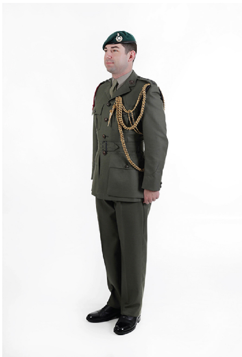
Fig 40A-3c. Junior officer (ADC) in No. 1C Lovat Undress