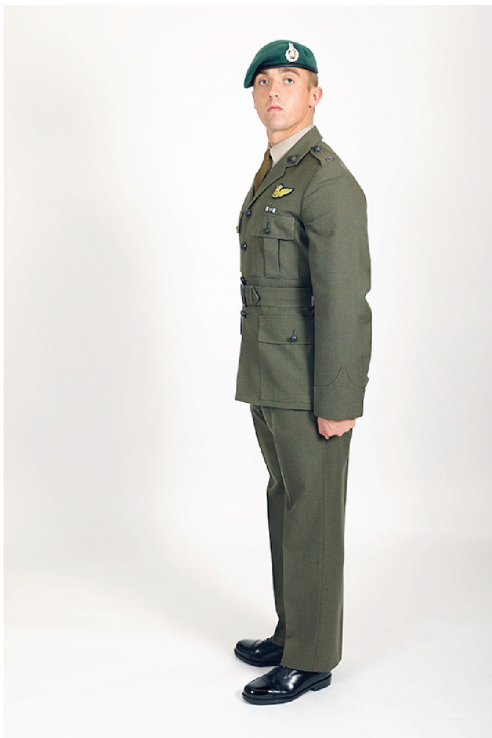
Fig 40A-3g. Mne in No. 1C Lovat Undress