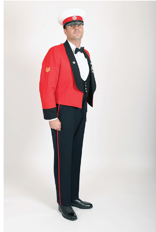
Fig 40A-4d. SNCO in No. 2A Mess Dress