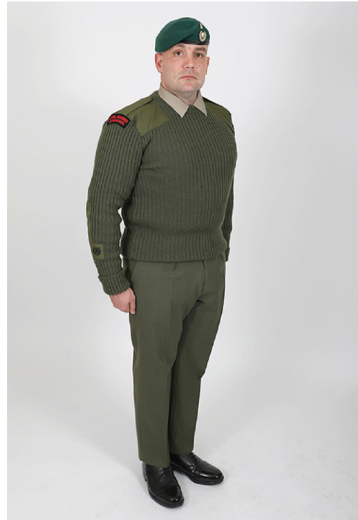
Fig 40A-9b. WO2 in No. 3C Dress